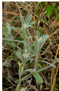
Cudweed ( Gamochaeta spp.)