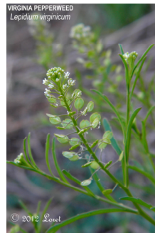
Virginia Pepperweed ( Lepidium virginicum )