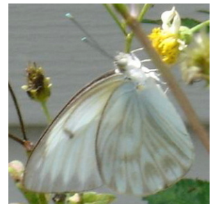
Great Southern White ( Ascia monuste )