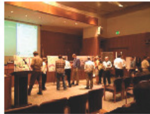
A well attended public information meeting was held in the City of Kissimmee Chambers in October, 2012.