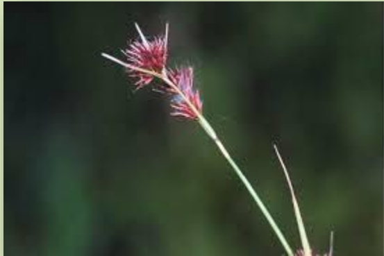
Rhynchospora sp. (Beak Rush)