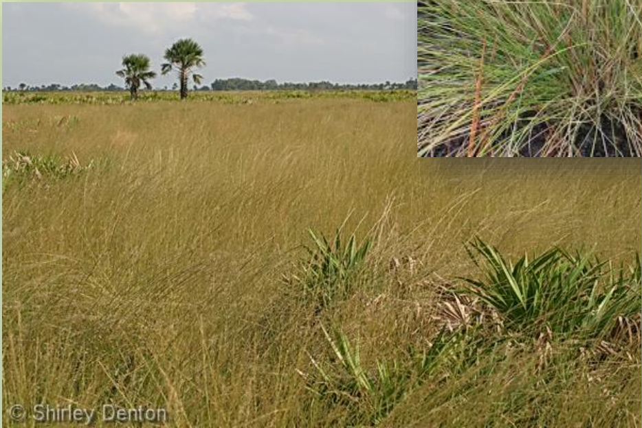
Aristida stricta var. beyrichiana (Wiregrass)