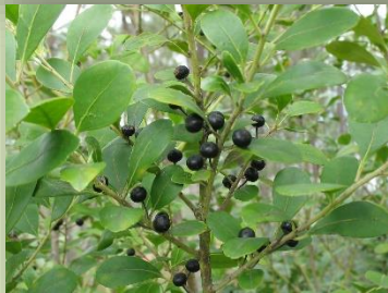
Ilex glabra (Gallberry)