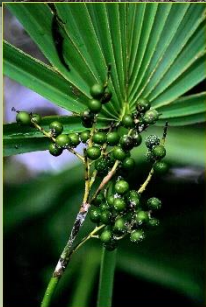
Serenoa repens (Saw Palmetto)