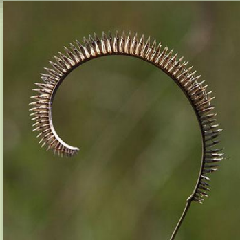
Ctenium aromaticum (Toothache Grass)